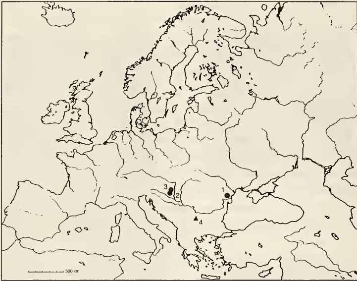
Fig. 4. Geographical range of Otis khosatzkii : 1 - Etulya in SW Moldova (after BOCHENSKI & KUROCHKIN, 1987); 2 - Beremend in S Hungary (after JANOSSY, 1991); 3 - Polgardi in S Hungary (after JANOSSY, 1991), 4 - Varshets in NW Bulgaria (present paper)